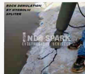
Rock Demolition by Hydraulic Splitter