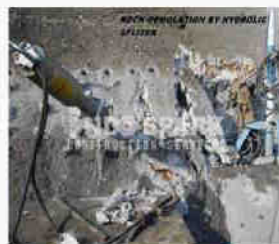
Rock Demolition by Hydraulic Splitter - Koyana Dam Demo