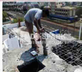
Concrete Demolition by Hydraulic Splitter