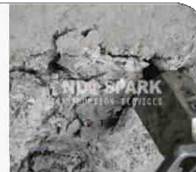
Demolition by Hydraulic Splitter - Koyana Dam Demo