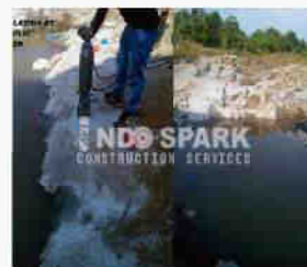
Rock Demolition by Hydraulic Splitter