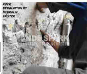
Rock Demolition by Hydraulic Splitter - Koyana Dam Demo